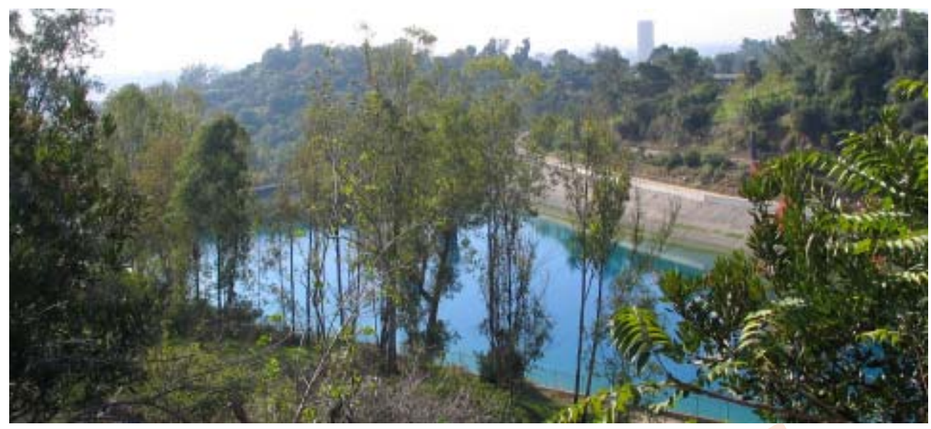
ELYSIAN RESERVOIR FROM POINT GRAND VIEW DRIVE