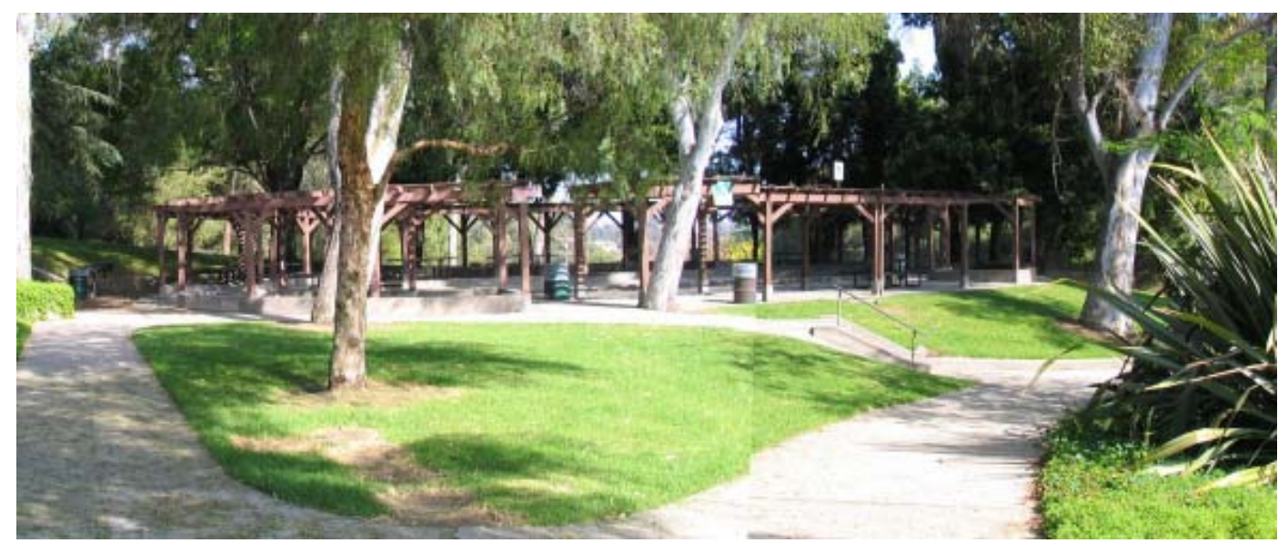
THE ARBOR OUTSIDE THE ADAPTIVE RECREATION AREA IS USED FOR PROGRAM ACTIVITIES AND FOR GROUP PICNICS

from this area is spectacular and a short loop trail through walnut woodlands would provide family educational opportunities. Picnic tables, a trellis shade structure, and limited parking would also serve as overflow to the popular Elysian Fields picnic area. The new picnic area should remain rustic and seating should be located away from the edge of the slope.